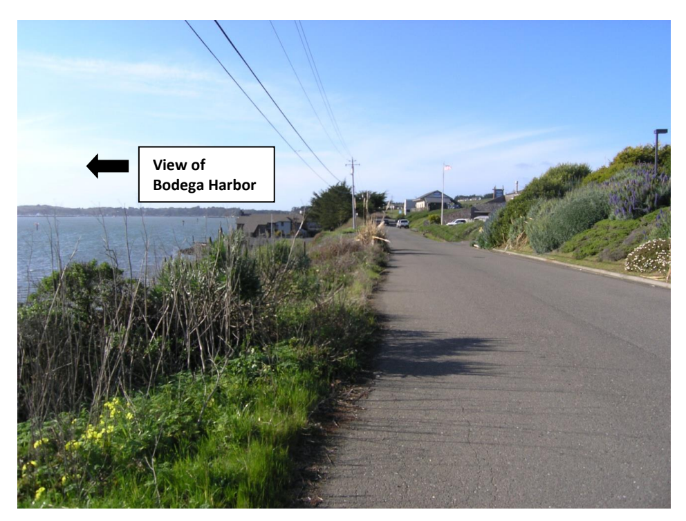
Current Condition of Smith Brothers Road Looking North