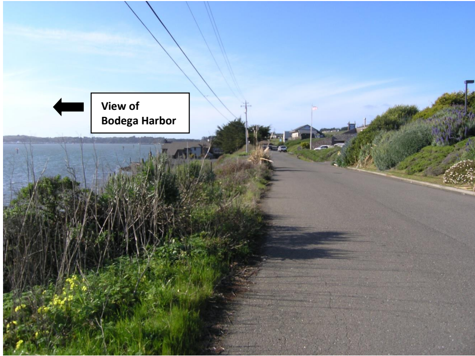
Current Condition of Smith Brothers Road Looking North